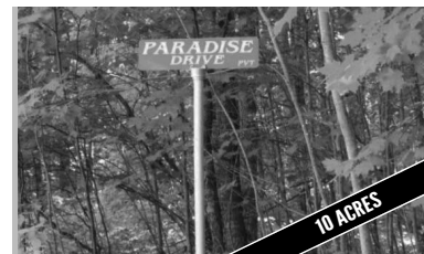
TBD PARADISE DRIVE, ALBA A very nice parcel with many possibilities, Short walking distance to be at the edge of 18,000 acres of state owned land. MLS 440212. Ask for Chris Oliver. $18,500