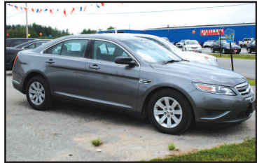
2011 FORD TAURUS Sirius, CD. Only 60 K. 29 MPG. SALE PRICE $15,995