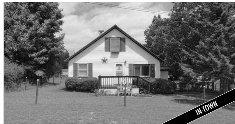
602 HURON STREET, EAST JORDAN • $74,900 This home would be perfect for snowmobilers, skiers, boaters or just anyone looking for that upnorth getaway! Walking distance to the beach and downtown. Great summer boat slip rates too! Perfectly located right in between Boyne Mountain & Shanty Creek. MLS 441326. Ask for Jennifer Burr.