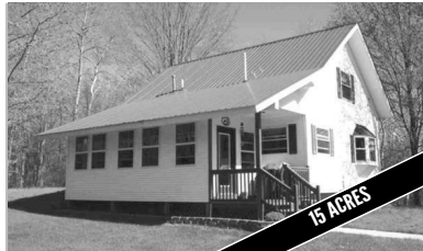
05120 BC/EJ, EAST JORDAN Well constructed like new home close to town. Includes 15 acres with a 30 x 40 insulated, heated pole barn. MLS 440712. Ask for Mike Stark. $169,000