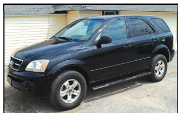
2003 KIA SORENTO LX 3.5 L, 6 Cyl, air. AS LOW AS $199 A MONTH Payments may vary depending upon credit history and down payment.