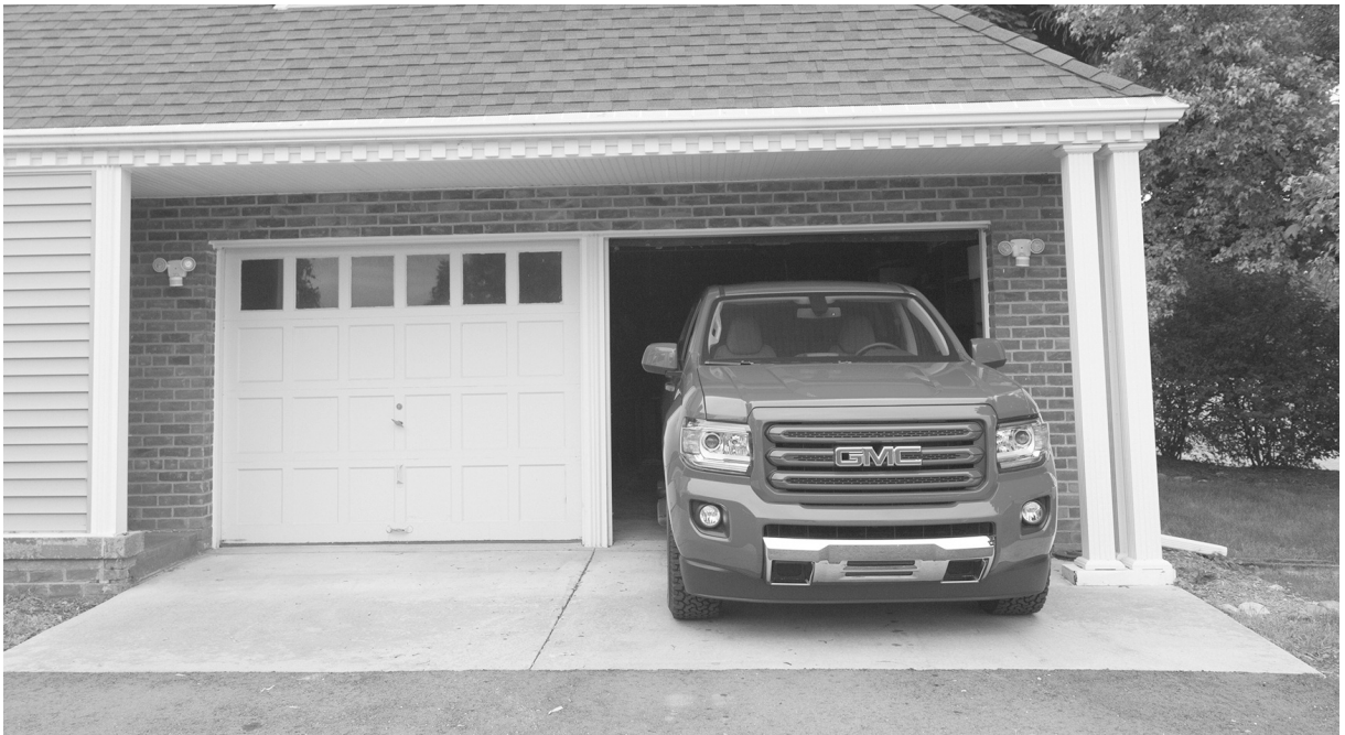
2015 GMC Canyon Crew Cab SLE midsize pickup truck can easily fit into garage parking. PHOTO © GENERAL MOTORS."