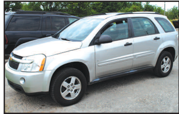
2007 CHEVY EQUINOX LS AWD, tow pkg. SALE PRICE $8,999