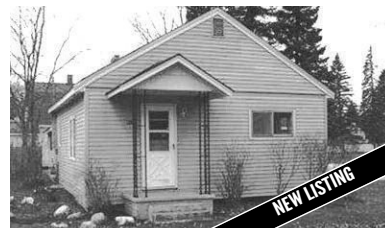
509 FOURTH STREET, EAST JORDAN Turnkey home, within walking distance to schools and down town. Newer roof, attached garage and quiet neighborhood. MLS 440288. Ask for Mike Stark. $59,900