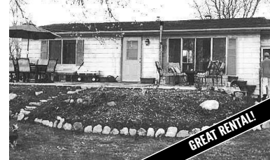
4183 CINDER HILL ROAD • ALBA Newly remodeled 2 bedroom home on a double lot with an attached garage. This would make a great getaway spot close to skiing and snowmobiling. MLS 438758. Ask for Holly Nierman. $46,000