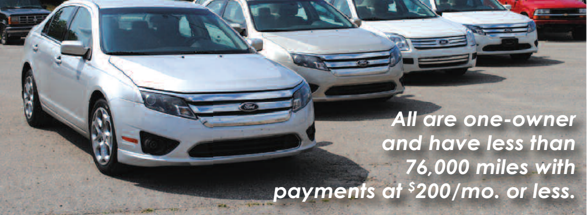
All are one-owner and have less than 76,000 miles with payments at $200/mo. or less.

5 FORD FUSIONS IN STOCK and READY TO GO! 2009-2012