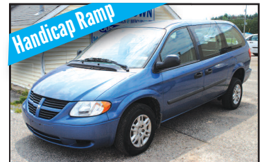
2007 DODGE GRAND CARAVAN Hard to find Handicap Van, Ramp, CD, cassette. SALE PRICE $11,999