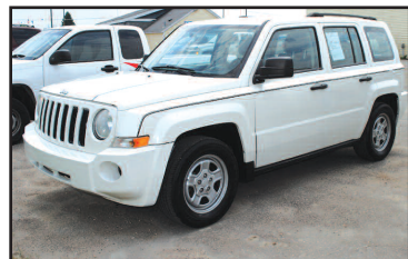
2010 JEEP PATRIOT Only 36 K. Nice, low, low miles. SALE PRICE $11,999