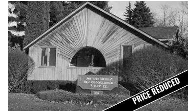
306 MAIN STREET EAST JORDAN Professional building in East Jordan in turn key condition, it also has its own parking lot. MLS 438990. Ask for Holly Nierman. $115,000