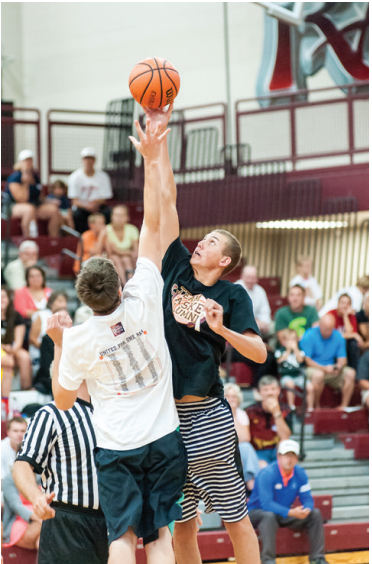
Let the competition begin. The Haske Alumni Fundraiser basketball game opening tip.