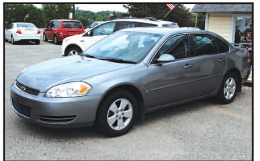
2006 CHEVY IMPALA LT 31 MPG. Only 79 K. SALE PRICE $8,999