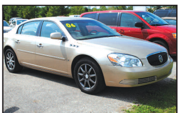
2006 BUICK LUCERNE CXL Leather, steering wheel controls, OnStar SALE PRICE $6,999

989 VFW RD., CHEBOYGAN, MI • 231-627-6700 • WWW.RIVERAUTO.NET