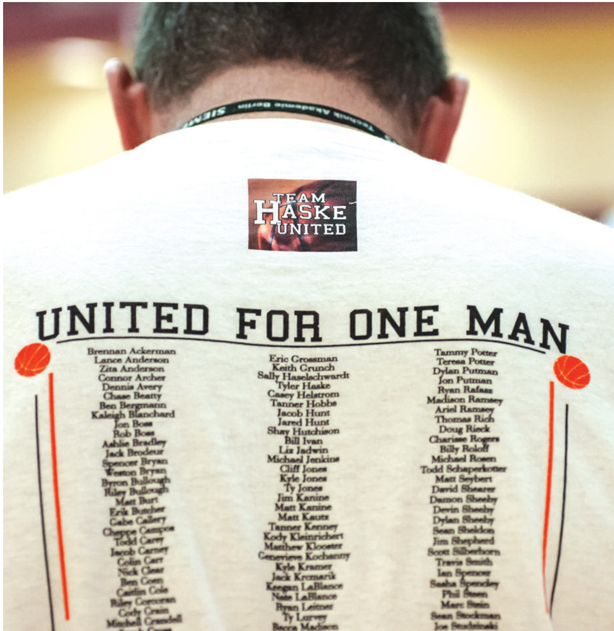
The participants wore Team Haske Alumni shirts with each player named on the back.