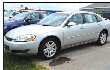
2006 CHEVY IMPALA LT Power moonroof, Bose sound, steering wheel controls, 31 MPG. SALE PRICE $7,999