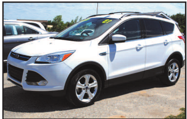
2013 FORD ESCAPE SE Eco-Boost, Sirius radio, steering wheel controls, SYNC, handsfree phone. Like new. $269 A MONTH OR LESS