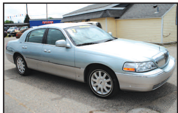
2007 LINCOLN TOWN CAR Signature Series, Leather, loaded, 99 K. SALE PRICE $11,900

GREAT SELECTION AT THE LOWEST PRICES IN THE NORTH TONS OF VEHICLES IN STOCK. MORE ARRIVING DAILY!