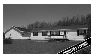
2403 W M-32, EAST JORDAN This 3 bed 2 bath home sits in a beautiful countryside setting including 8 acres. Garage is attached and heated. MLS 440704. Ask for Jennifer Burr. $149,000