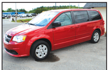
2012 DODGE GRAND CARAVAN Stow-N-Go, 4 captain's chairs, like new. SALE PRICE $13,995

5 FORD FUSIONS IN STOCK and READY TO GO! 2009-2012