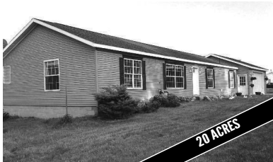
7890 BURGESS ROAD, CHARLEVOIX Picturesque country setting and centrally located to Charlevoix, Boyne City and Petoskey. MLS 439512. Ask for Jennifer Burr. $126,900