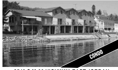
2540 S M-66 HIGHWAY, EAST JORDAN 2199sq ft condo with 22ft waterfront on the SOUTH ARM OF LAKE CHARLEVOIX. 3 BR, 3 1/2 BA, new deep water boat slip. MLS 440455. Ask for Mike Stark. $299,900

109 Mill Street • East Jordan • 231-536-7700