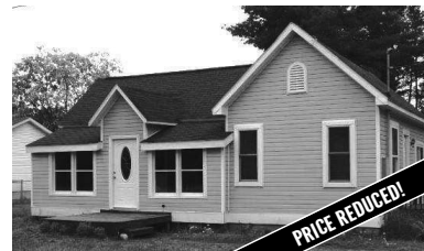
101 WILSON DRIVE • EAST JORDAN Recently updated 3 bedroom home located with in the city limits. New flooring, interior paint, appliance and windows. MLS 441103. Ask for Mike Stark. $59,900